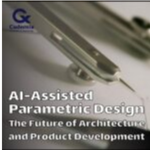
AI-Assisted Parametric Design: The Future of Architecture and Product Development