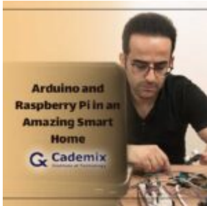
Arduino and Raspberry Pi in an Amazing Smart Home