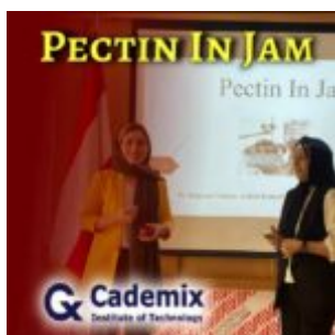
Pectin In Jam