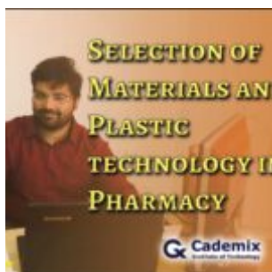
Selection of Materials and Plastic Technology in Pharma