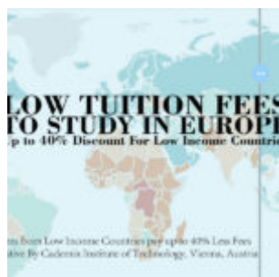
Lower Tuition Fees for Low Income Countries