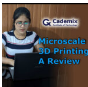
Microscale 3D Printing: A Review