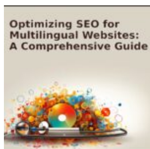
Optimizing SEO for Multilingual Websites: A Comprehensive Guide