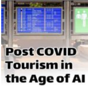
Post-COVID Tourism in the Age of AI