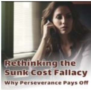
Rethinking the Sunk Cost Fallacy : Why Perseverance Pays Off