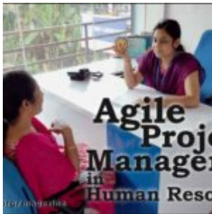
HR Agile Management - Agile Project Management in Human Resource