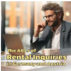
The ABCs of Rental Inquiries in Germany and Austria: Effective Communication Tactics with Landlords