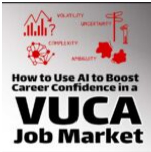
How To Use AI To Boost Career Confidence In A VUCA Job Market