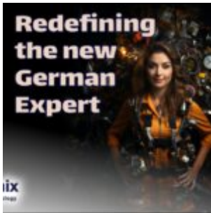
Redefining the New German Expert: From Lifelong Specialization to Cross-Functional Skills