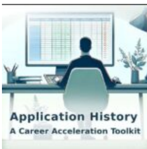
Application History: A Career Acceleration Toolkit