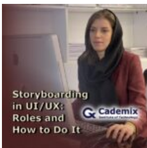
Storyboarding in UI/UX: Roles and How to Do It