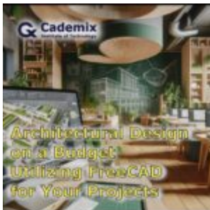
Architectural Design on a Budget: Utilizing FreeCAD for Your Projects