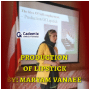
Production of Lipstick