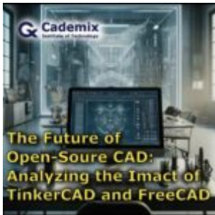
The Impact of TinkerCAD and FreeCAD in the Industry