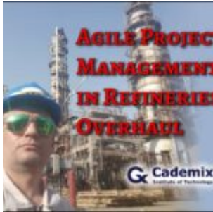
Agile Project Management in Refineries Overhaul