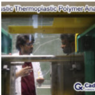
Acoustic Thermoplastic Polymer Analysis