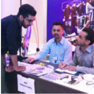
Austria : Top destination for Pakistani graduates