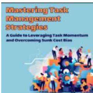
Mastering Task Management Strategies: A Guide to Leveraging Task Momentum and Overcoming Sunk Cost B...