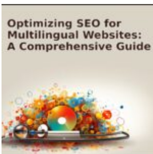
Optimizing SEO for Multilingual Websites: A Comprehensive Guide