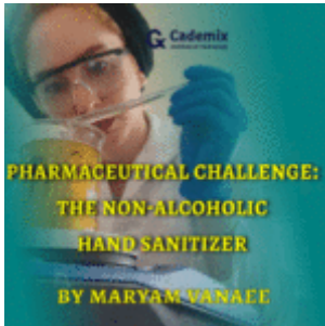
Pharmaceutical challenge: the non-alcoholic hand sanitizer