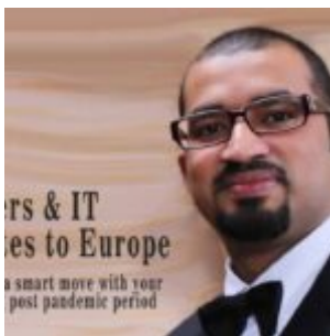
Engineers & IT Graduates to Europe: Art of making a smart move with your career during post pandemic...