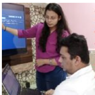
Information Technology & Collaboration: The Key to thrive business teams