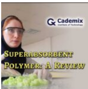
Superabsorbent Polymer – A Review