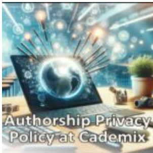
Authorship Privacy Policy at Cademix: A Balance of Anonymity and Accountability