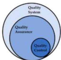
Quality Assurance & Quality Control