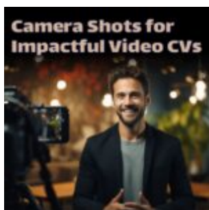
Mastering Camera Shots for Impactful Video CVs and Educational Content