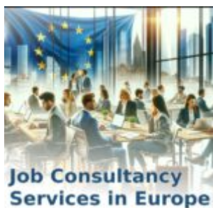
Job Consultancy Services in Europe