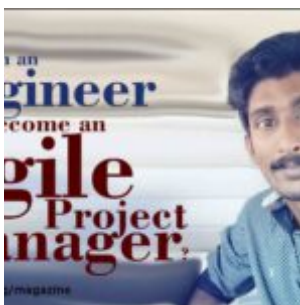
How can an Engineer become an Agile Project Manager?