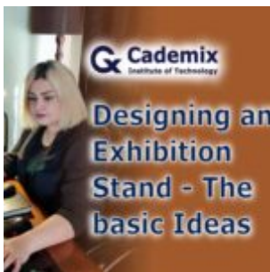
Designing an Exhibition Stand - The basic Ideas