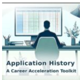
Application History: A Career Acceleration Toolkit