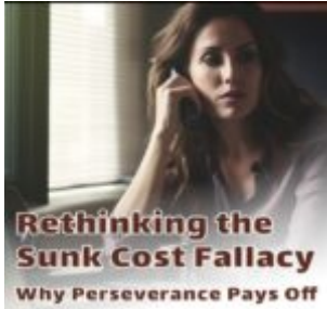
Rethinking the Sunk Cost Fallacy : Why Perseverance Pays Off