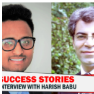
From India to a Research Position in Berlin