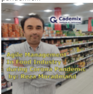
Agile management In Food Industry during Corona Pandemic