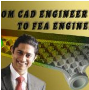
How to become a FEA Simulation Engineer from a CAD Design Engineer