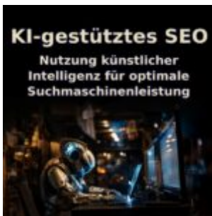
KI-gestütztes SEO: Nutzung künstlicher Intelligenz für optimale Suchmaschinenleistung