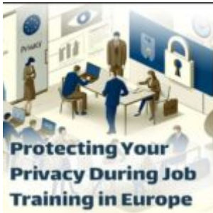
Protecting Your Privacy During Job Training in Europe