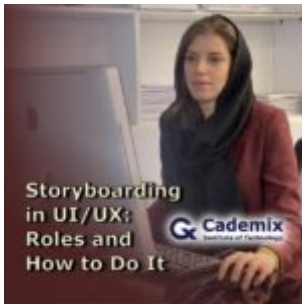
Storyboarding in UI/UX: Roles and How to Do It