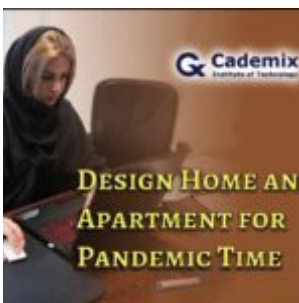
Design Home and Apartment for Pandemic Time