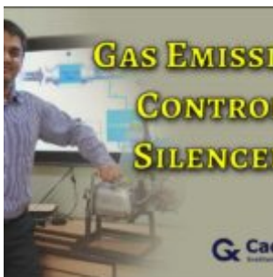
Gas Emission Control Silencer