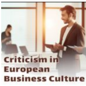
Criticism in European Business Culture