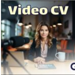
Video CV: 2023 Strategic Approach to Stand Out in the Competitive Job Market