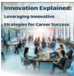
Innovation Explained: Leveraging Innovative Strategies for Career Success