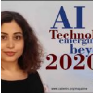
AI Technologies emerging beyond 2020