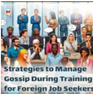
Strategies to Manage Gossip During Training for Foreign Job Seekers