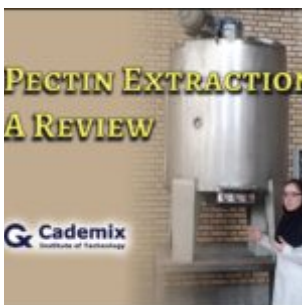
Pectin Extraction – A Review