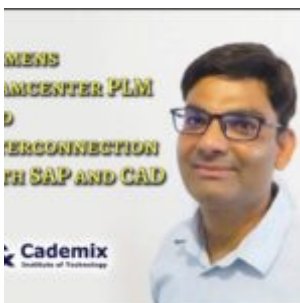
Siemens Teamcenter PLM and Interconnection with SAP and CAD