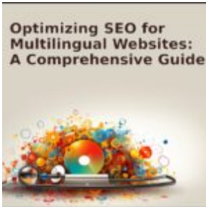
Optimizing SEO for Multilingual Websites: A Comprehensive Guide