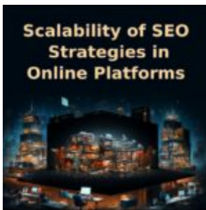
Scalability of SEO Strategies in Online Platforms