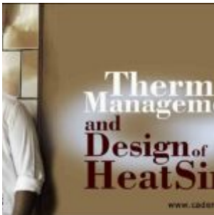
Thermal Management and Design of Heat Sinks