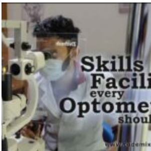
Top Skills and Facilities Every Optometrist Should Know