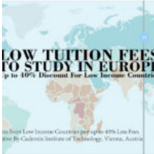
Lower Tuition Fees for Low Income Countries