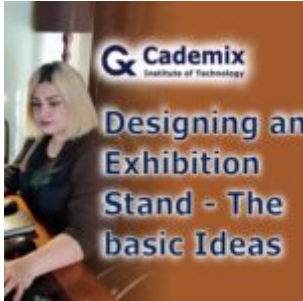
Designing an Exhibition Stand - The basic Ideas