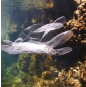
Global Impact of Plastics and Its Recycling