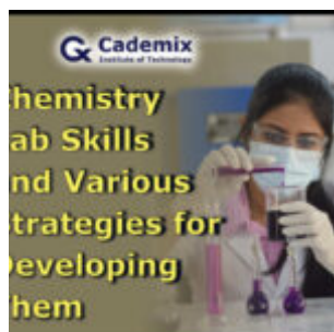
Chemistry Lab Skills and Various Strategies for Developing Them