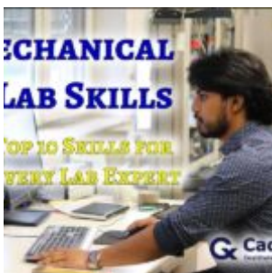
Mechanical and Lab Skills - Top 10 Skills for Every Lab Expert