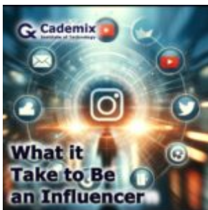
What It Takes to Be an Influencer