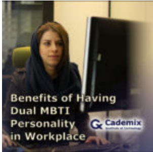
Benefits of Having Dual MBTI Personality in Workplace