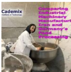
Comparing Industrial Machinery Manufacturing Iran and Germany's Food Processing