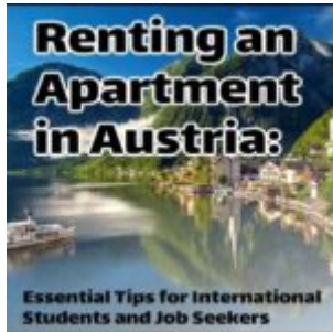
Renting an Apartment in Austria: Essential Tips for International Students and Job Seekers