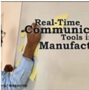
Real-Time Communication Tools in Manufacturing Sector