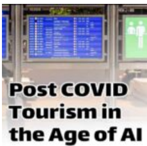
Post-COVID Tourism in the Age of AI