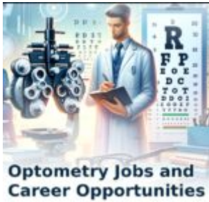
Optometry Jobs and Career Opportunities for 2024: A Comprehensive Guide