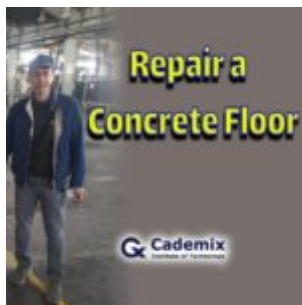
Repair a Concrete Floor