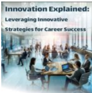
Innovation Explained: Leveraging Innovative Strategies for Career Success