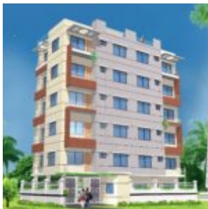
3D rendering in the construction industry