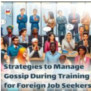
Strategies to Manage Gossip During Training for Foreign Job Seekers