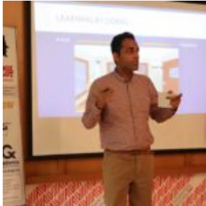
Learning By Doing