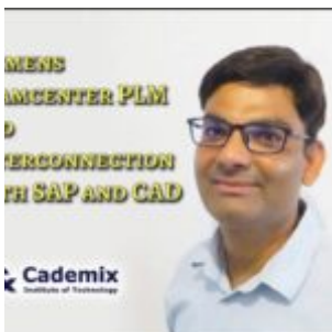
Siemens Teamcenter PLM and Interconnection with SAP and CAD