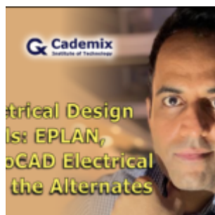
Electrical Design Tools: EPLAN, AutoCAD Electrical and the Alternates