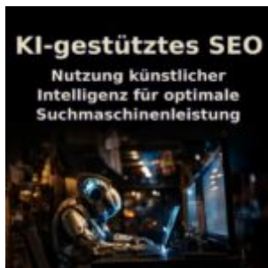
KI-gestütztes SEO: Nutzung künstlicher Intelligenz für optimale Suchmaschinenleistung