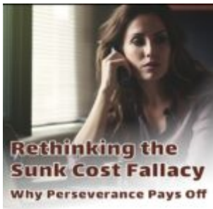
Rethinking the Sunk Cost Fallacy : Why Perseverance Pays Off