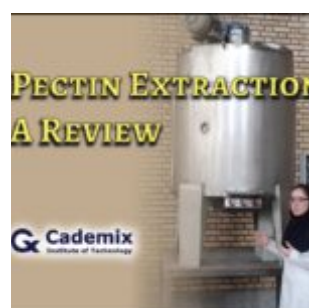
PECTIN EXTRACTION A REVIEW Pectin Extraction – A Review