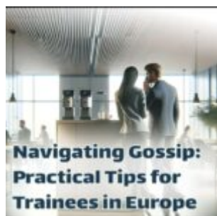
Navigating Gossip: Practical Tips for Trainees in Europe