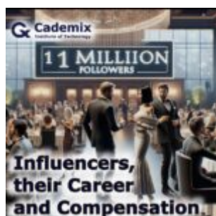
Influencers, their Career and Compensation