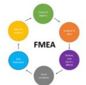
FMEA Insights in Manufacturing Industry