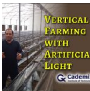
Vertical Farming with Artificial Light: Review and Future Advancement