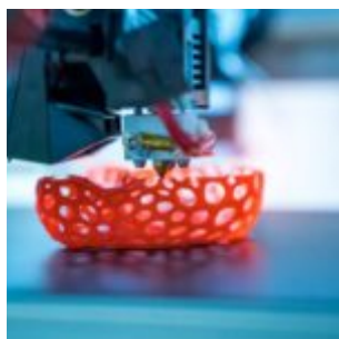
3D Printing in Medical Industry