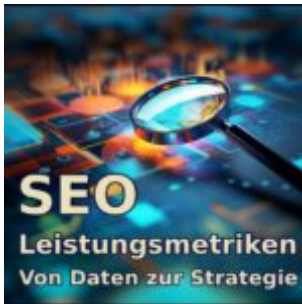
SEO-Leistungsmetriken: Von Daten zur Strategie