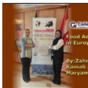
Food Additives in Europe