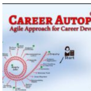
Cademix introduces a new career autopilot system for jobseekers, graduates and students