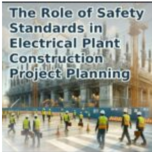
The Role of Safety Standards in Electrical Plant Construction Project Planning: 2024 Update