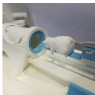
Low cost & Portable MRI Systems - A step toward democratization of Health Care