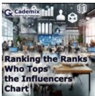
Ranking the Ranks: Who Tops the Influencer Charts?