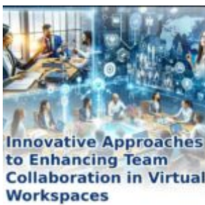
Innovative Approaches to Enhancing Team Collaboration in Virtual Workspaces