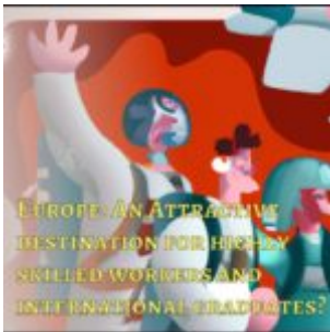
Why Europe is very attractive destination for highly skilled workers and international tech graduate...