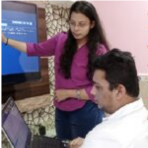
Information Technology & Collaboration: The Key to thrive business teams