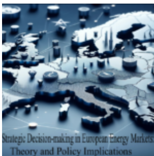
Strategic Decision-making in European Energy Markets: Theory and Policy Implications