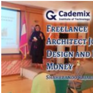
Freelance Architect Job, Design and Make Money