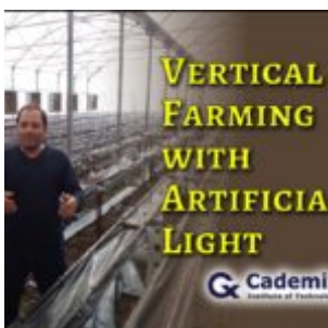
Vertical Farming with Artificial Light: Review and Future Advancement