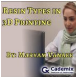
Resin Types in 3D Printing