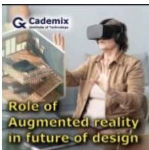
Role of Augmented Reality in the Future of Design