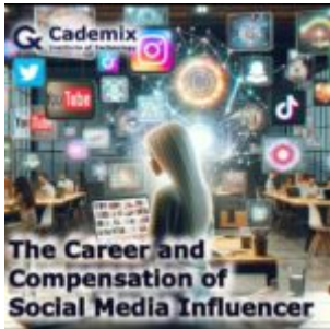
Followers, Fame, and the Making of an Influencer