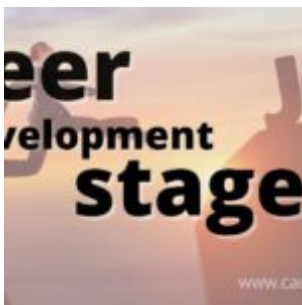
Career Development Stages