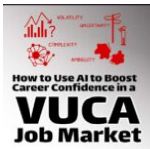
How To Use AI To Boost Career Confidence In A VUCA Job Market