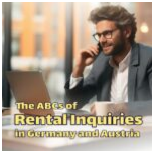
The ABCs of Rental Inquiries in Germany and Austria: Effective Communication Tactics with Landlords