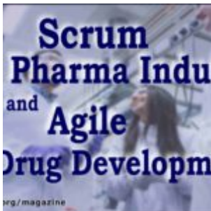
Scrum in Pharma Industry and Agile Drug Development