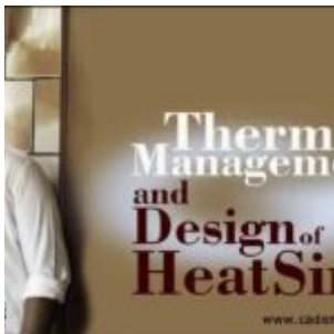
Thermal Management and Design of Heat Sinks