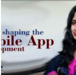
How AI is Shaping Mobile App Development