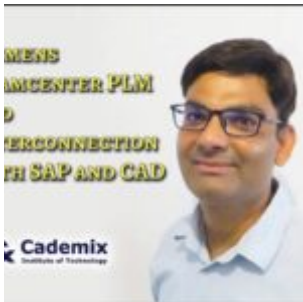
Siemens Teamcenter PLM and Interconnection with SAP and CAD