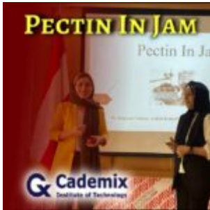
Pectin In Jam