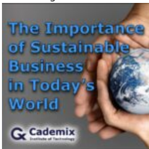
The Importance of Sustainable Business in Today's World