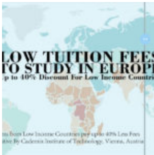
Lower Tuition Fees for Low Income Countries