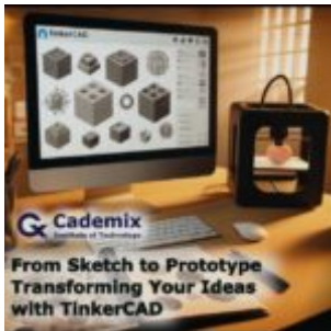
From Sketch to Prototype: Transforming Your Ideas with Tinkercad