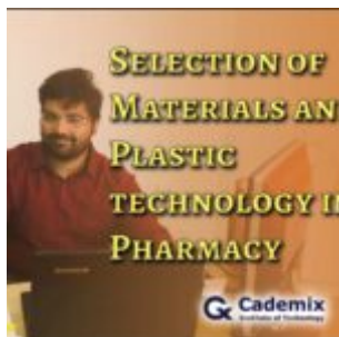
Selection of Materials and Plastic Technology in Pharma