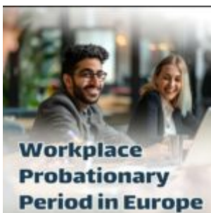
Workplace Probationary Period in Europe: 2024 Update Guide for International Job Seekers