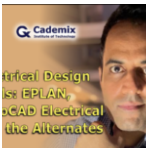
Electrical Design Tools: EPLAN, AutoCAD Electrical and the Alternates