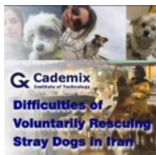
Difficulties of Voluntarily Rescuing Stray Dogs in Iran