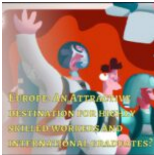
Why Europe is very attractive destination for highly skilled workers and international tech graduate...