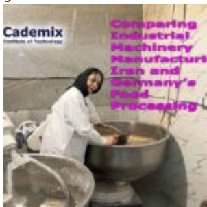
Comparing Industrial Machinery Manufacturing Iran and Germany's Food Processing