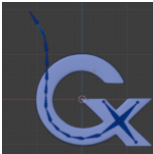
3D Rigging of Logos for Character Animation: Practical Steps