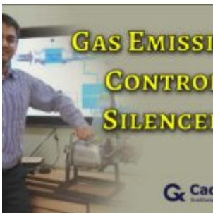
Gas Emission Control Silencer