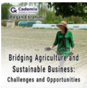
Bridging Agriculture and Sustainable Business: Challenges and Opportunities