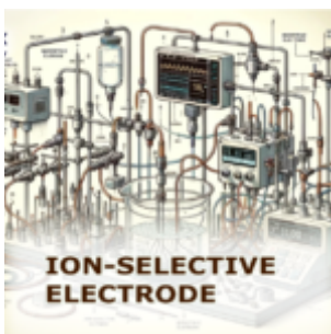
How do Ion-Selective Electrodes Regulate Diseases? A Comprehensive Review