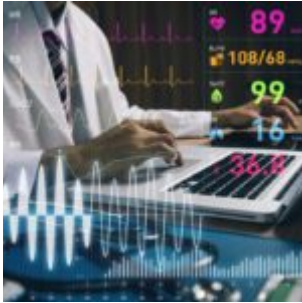
Patient Health Record Systems and GDPR Compliance