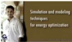
Simulation and modeling techniques for energy optimization