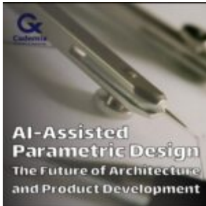
AI-Assisted Parametric Design: The Future of Architecture and Product Development