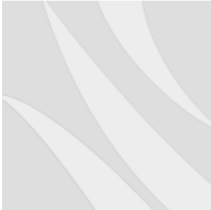
Aquaponik Südburgenland: Die Initiative