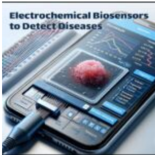
Electrochemical Biosensors: Revolutionizing Point of Care Diagnostics- An Overview