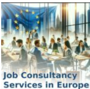
Job Consultancy Services in Europe