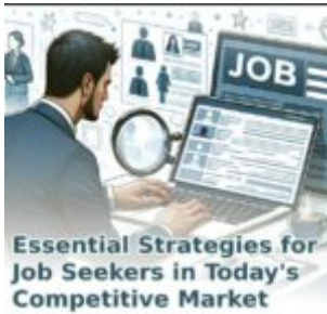
Essential Strategies for Job Seekers in Today's Competitive Market