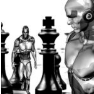
How to meet AI Robot Recruiters in your next job application