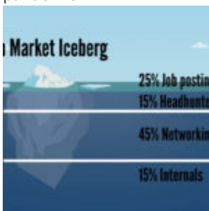
The Hidden Job Market