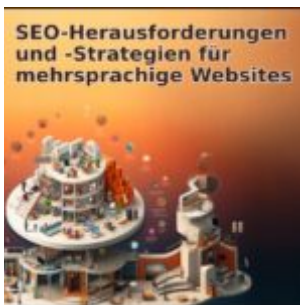
SEO-Herausforderungen und -Strategien für mehrsprachige Websites