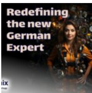
Redefining the New German Expert: From Lifelong Specialization to Cross-Functional Skills