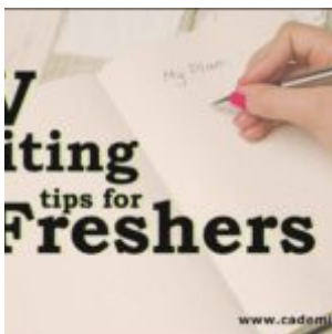
CV writing tips for freshers