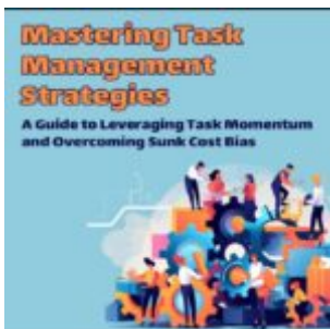
Mastering Task Management Strategies: A Guide to Leveraging Task Momentum and Overcoming Sunk Cost B...