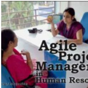
HR Agile Management - Agile Project Management in Human Resource