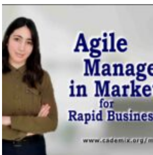
Agile Management in Marketing for Rapid Business Growth