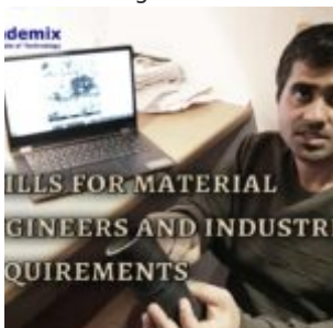
Skills for material engineers and industrial requirements