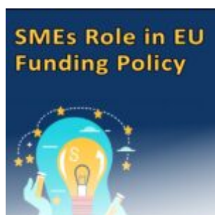
Importance of SMEs role in EU Funding policy