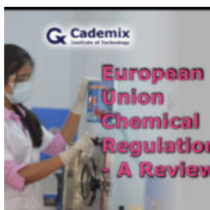
European Union Chemical Regulations - A Review