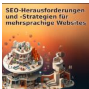
SEO-Herausforderungen und -Strategien für mehrsprachige Websites