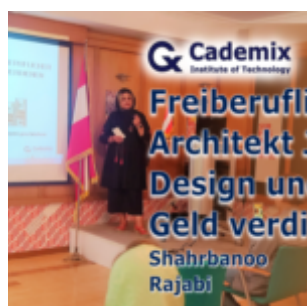
Freiberuflischer Architektenjob, Design und Geld verdienen