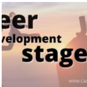
Career Development Stages