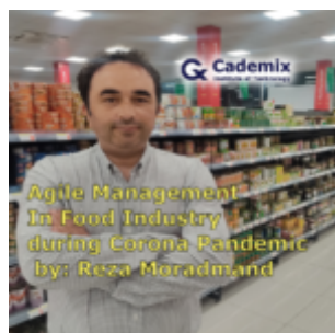
Agile management In Food Industry during Corona Pandemic