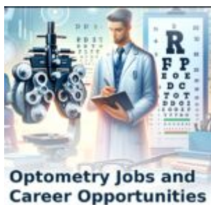
Optometry Jobs and Career Opportunities for 2024: A Comprehensive Guide