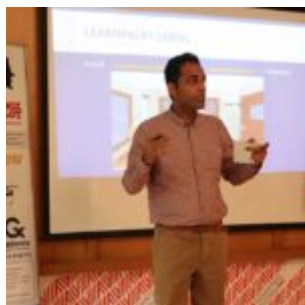
Learning By Doing