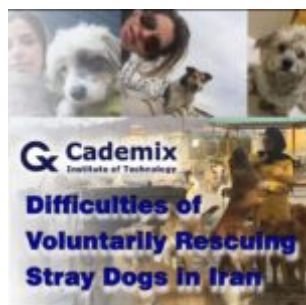
Difficulties of Voluntarily Rescuing Stray Dogs in Iran