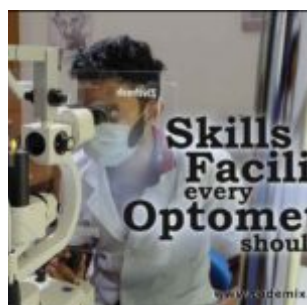
Top Skills and Facilities Every Optometrist Should Know