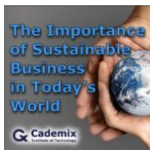
The Importance of Sustainable Business in Today's World