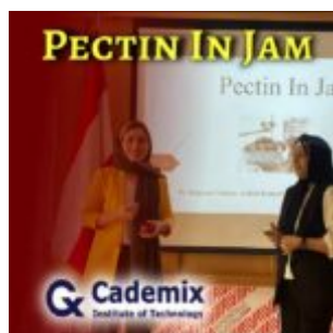
Pectin In Jam