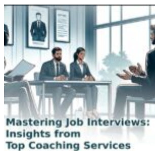
Mastering Job Interviews: Insights from Top Coaching Services