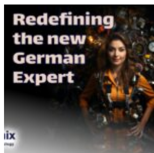
Redefining the New German Expert: From Lifelong Specialization to Cross-Functional Skills