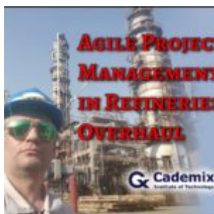
Agile Project Management in Refineries Overhaul