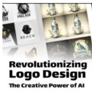
Revolutionizing Logo Design: The Creative Power of AI