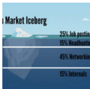
The Hidden Job Market