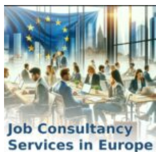
Job Consultancy Services in Europe